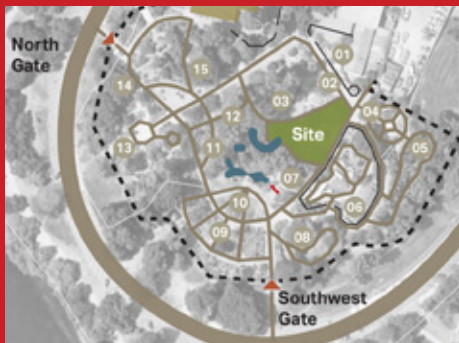
Site location within the Garden