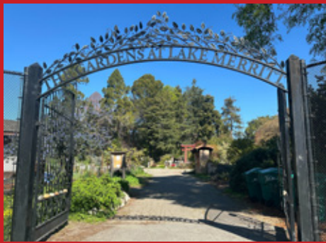
The Gardens of Lake Merritt entrance