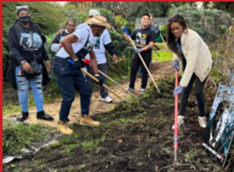
Hands-on tending the garden will provide healing and connection.

FOR MORE INFORMATION AND TO DONATE, VISIT: EASTBAYAIDSMEMORIAL.ORG