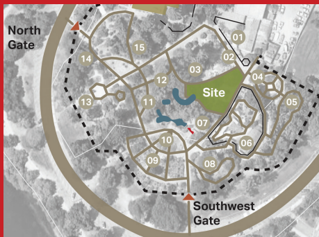
Site location within the Garden