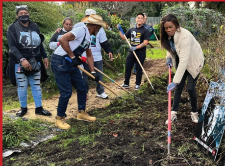
Hands-on tending the garden will provide healing and connection.

FOR MORE INFORMATION AND TO DONATE, VISIT: EASTBAYAIDSMEMORIAL.ORG