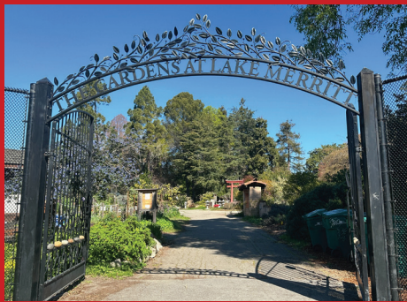
The Gardens of Lake Merritt entrance