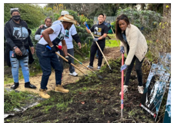
Hands-on tending the garden will provide healing and connection.

Rooted in Oakland's landscape and legacy, the garden will honor those living with HIV, remember those lost, and foster intergenerational dialogue about the HIV and LGBTQ+ experience. Conceived as an ecotherapy space, it will offer healing, reflection, and hands-on care—transforming remembrance into shared community connection.