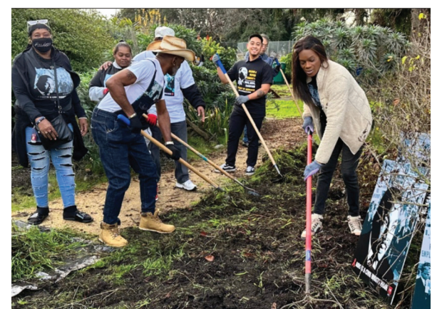
Hands-on tending the garden will provide healing and connection.

FOR MORE INFORMATION AND TO DONATE, VISIT: